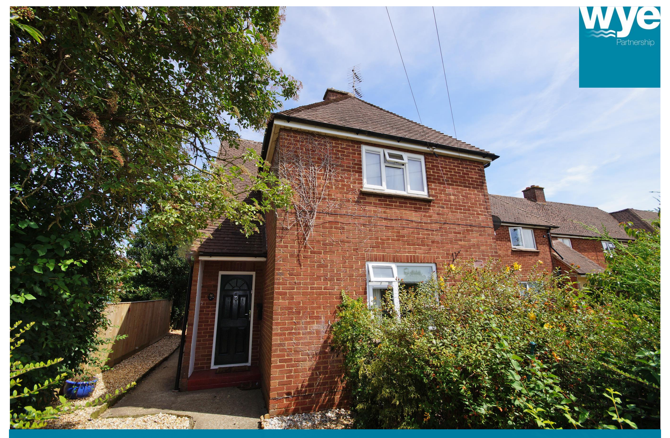
47 Gryms Dyke Prestwood Buckinghamshire HP16 0LP